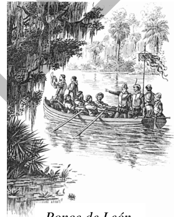
Ponce de León