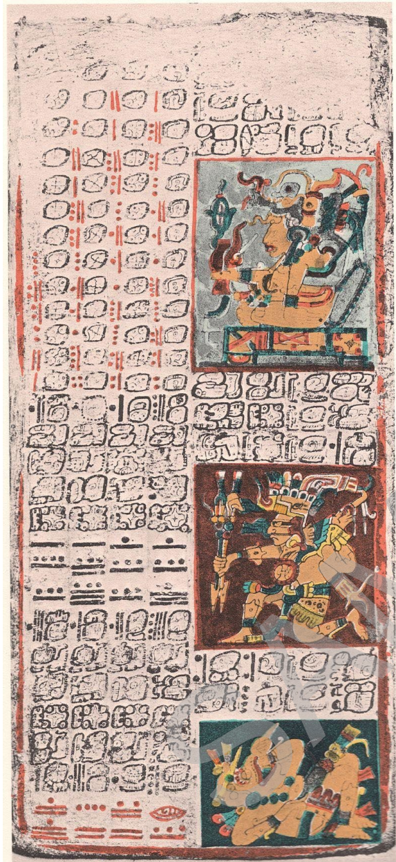
Mayan glyphs or hieroglyphics

Archaeologists have learned many important things about Mayan history and culture. The Mayans developed an advanced form of writing. They used hieroglyphics to write. Hieroglyphics are symbols that represent words and sometimes sounds. The Mayans put important dates and events on large stone monuments called stelae. The Mayans also made books made out of paper from fig tree bark. Most of the books were destroyed, but a few survived to give us clues about the Mayans.