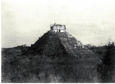
Castillo at Chichen Itza

The Mayan Empire was in its golden age during the Classic period. Cities grew, and the people developed complex language and mathematical concepts. At the end of the Classic period, around 900 AD, the Mayans disappeared from the regions they had inhabited throughout the period. Very few clues have been left as to why the cities were abandoned.