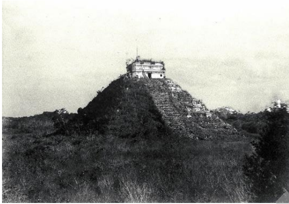
1892 Photo from Chichen Itza

Before the Spanish conquered Central America in the 1500s, the Central American area was known as Mesoamerica. One of the biggest groups of people living there were the Mayan people. Most of the people in this area were scattered groups, but the Mayans were mostly together in one region.