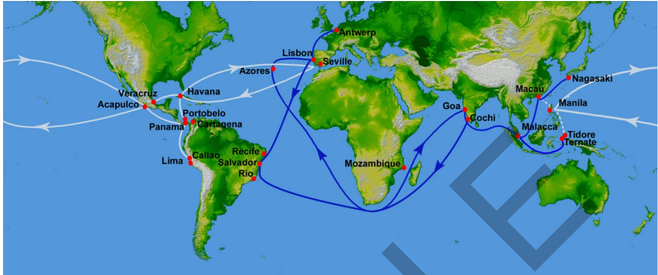
Portuguese Trade Routes (Blue) in 1568

Portugal launched the Age of Discovery. Among the pioneers in Portugal, one explorer was Prince Henry the Navigator. During his life, Henry the Navigator sent out more than fifty expeditions down the coast of Africa. His expeditions used a new type of boat called a caravel. He never went on the voyages himself, but his interest and curiosity prompted more Portuguese explorers to travel down the coast of Africa.