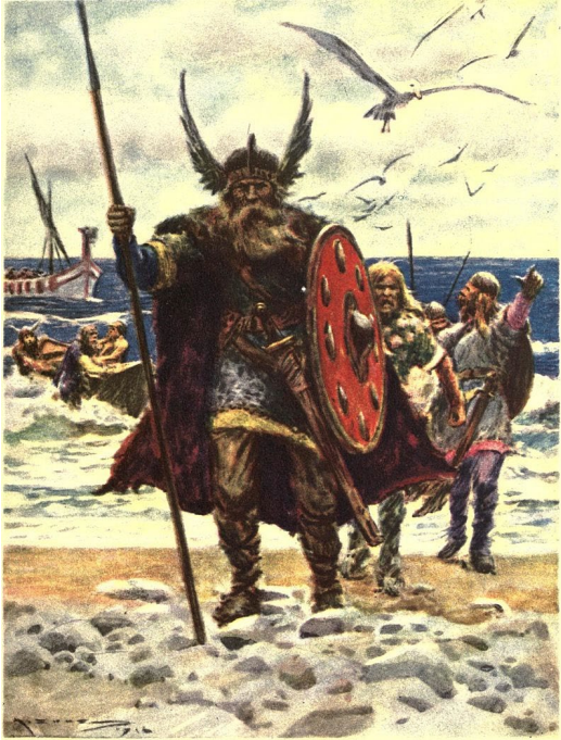
Painting of The Landing of The Vikings

Before Columbus found the new world, it was found by a Viking. Leif Eriksson was the son of Erik the Red who founded a settlement in Greenland. Leif became the leader of the settlement after his father's death.