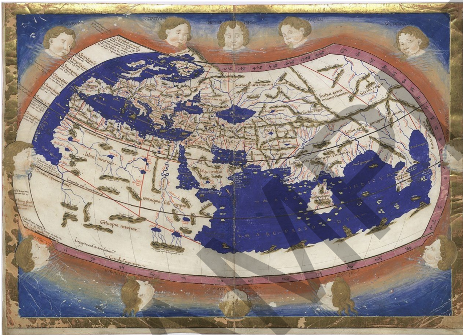
Ptolemy's World Map from the 2 nd Century

The Age of Discovery began primarily with Portugal and Spain. Portugal began the systematic mapping of the Atlantic and the coast of Africa in the early 1400s. Spain focused their attention on the new world and the Americas. France, England, and the Dutch all joined in the exploration and discovery but much later.