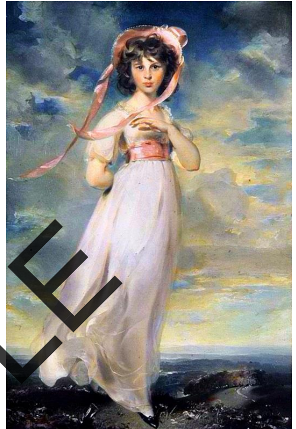
Fig. 23 Pinkie by Thomas Lawrence.

Learn more about Pinkie at https://en.wikipedia.org/wiki/Pinkie_(painting)