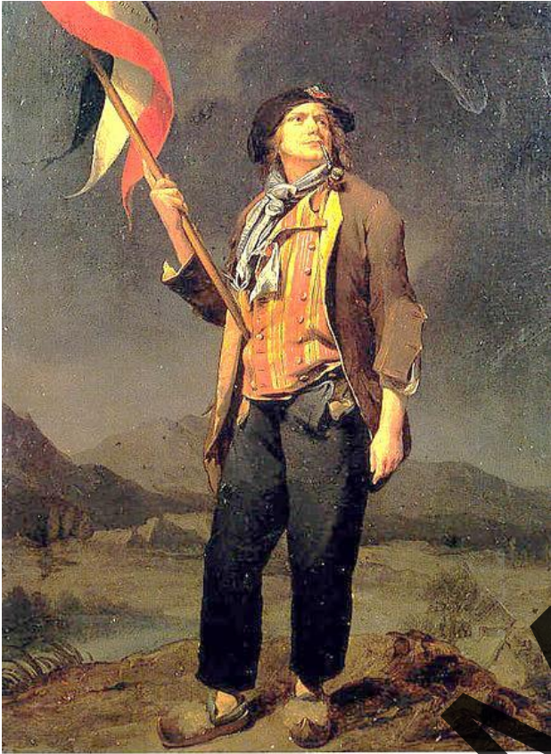
Fig. 16 Portrait of a Sans Culotte by Louis-Leopold Boilly.

“Sans Culottes” were French common men who did not wear the short pants and silk stockings of the aristocracy.