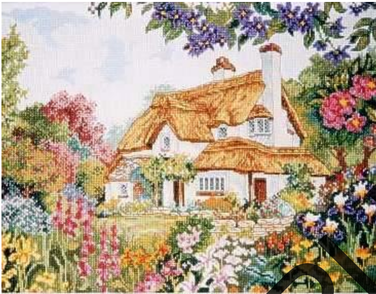
Fig. 24 “Periwinkle Cottage” counted cross-stitch picture from Microsoft Word Clipart.

Cross-stitching is a very well-known hobby. You may know someone who practices this craft.