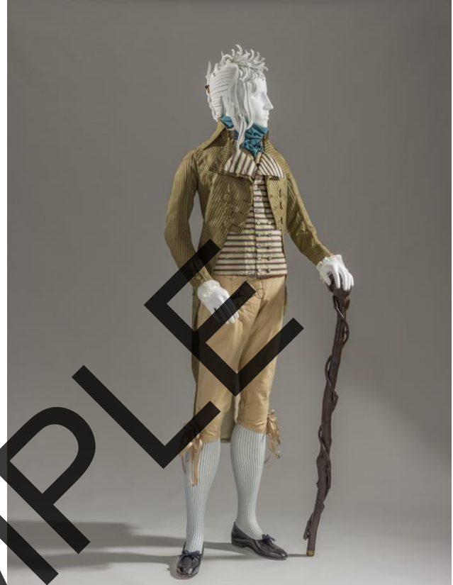
Fig. 17 1790s Ensemble. Short pants continued to be worn, especially for formal occasions, into the 1810s.

“Sans Culottes” were French common men who did not wear the short pants and silk stockings of the aristocracy.