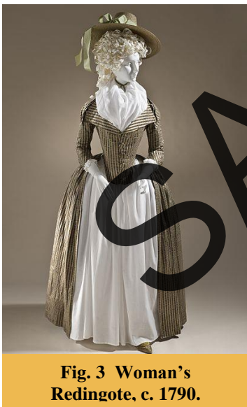
Fig. 3 Woman's Redingote, c. 1790.

At the start of the Revolution, the French people rose up, executing King Louis XVI and, later Queen Marie Antoinette. While the nobility was targeted first, within a few years no one was safe from being accused of being an enemy of the Revolution. During the period known as the Reign of Terror (1793-1794), around 17,000 people were