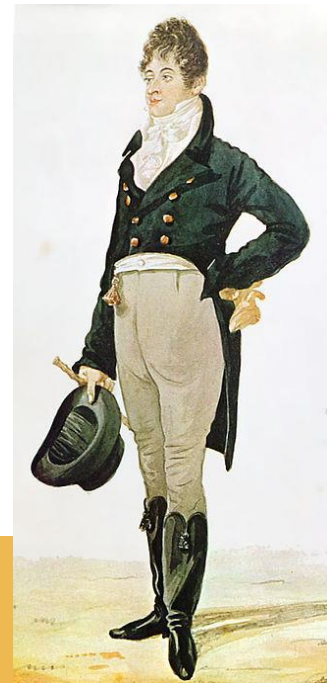
Fig. 18 Beau Brummel was the leader of men's fashion in England in the 1800s. Immensely proud of his cravats, Brummel sometimes boasted that it took him hours to dress.

Beau Brummel set the style for men during this time period. He was a “dandy,” and always impeccably dressed. He is considered the originator of the modern masculine “suit.”