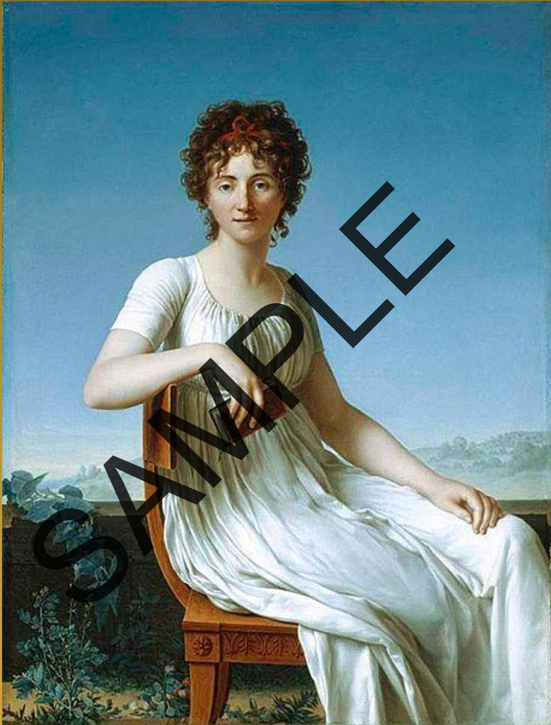
Portrait of Constance Pipelet by Jean-Baptiste Francoise