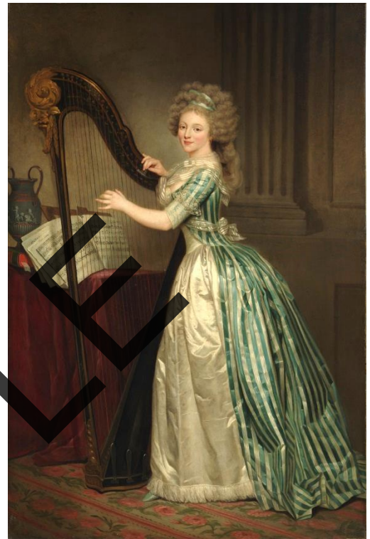
Fig. 2 Self-Portrait with a Harp by Rose Adelaide Ducreux c. 1791

Three of the goals of the Revolution had been " Liberté, égalité, fraternité " (liberty, equality, brotherhood). New styles of dress reflected equality, being simpler and using moderately-priced fabric and less of it so that more classes of people dressed in