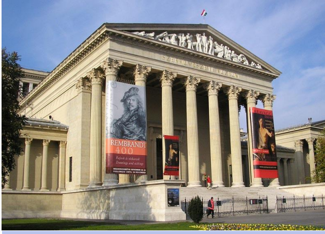
Fig. 25 There are many types of museums.

That may sound like a silly question, but you might be surprised at the answers you might get. Some people might say that a museum is a place with old things like spinning wheels and 1860s dresses. Other people might say that it is a place with even older things, like dinosaur bones or early arrow points. Some people might say that it is a place with art, and others that museums have rare and valuable items.