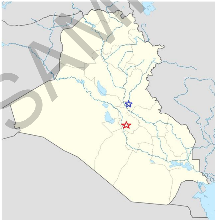
Figure 2 "Iraq location map" by NordNordWest - Own work using: United States National Imagery and Mapping Agency dataWorld Data Base II data. Licensed under CC BY-SA 3.0 via Commons.

Babylon was centred within the Tigris and Euphrates rivers as shown in the picture below. Babylon was also right in the middle of modern day Iraq (Babylon is indicated by a red star, modern Baghdad, the capital of Iraq, by a blue star).