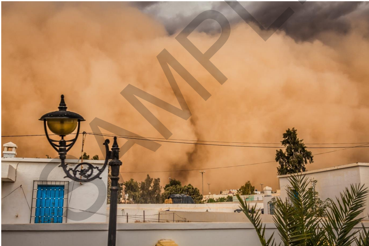
Figure 1 Sandstorm in Gafsa, Tunisia

SchoolhouseTeachers.com note: Parents should closely monitor children's use of YouTube and Wikipedia if you navigate away from the videos and articles cited in these lessons. We also recommend viewing the videos on a full screen setting in order to minimize your students' exposure to potentially offensive ads and inappropriate comments beside or beneath the video.