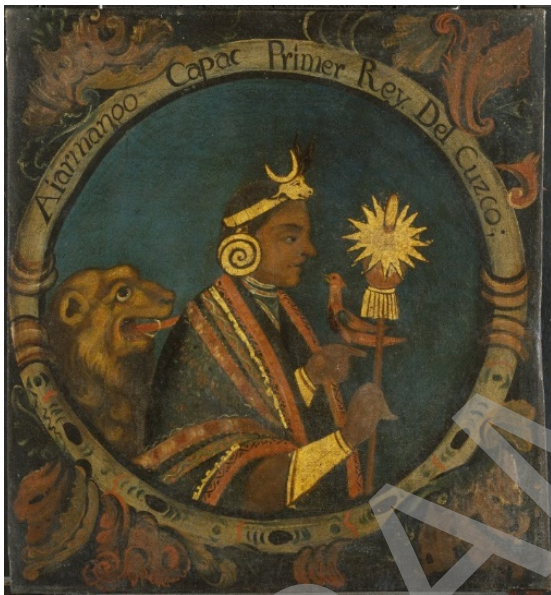
Manco Capac, Incan King

The Incas were a unique empire of people that lived in South America. Their empire spanned from the early 1400s until the mid-1500s. During this time, they conquered many people and made a vast empire. As a people, the Incas had a variety of strong beliefs on life, death, and creation. There are two different versions of the Incas creation story that exist.